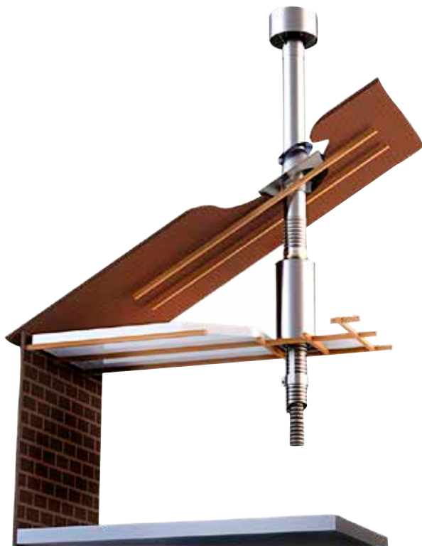
Typical Vertical Installation: 2DVK-VX